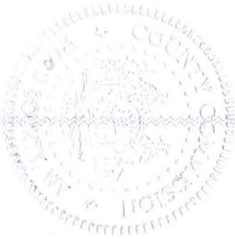
County Commission of Wood County

Mark Rhodes Wood County 02:20:32 PM Instrument No 8770891 Date Recorded 11/30/2017 Document Type COO Pages Recorded 1 Book-Page 74-317